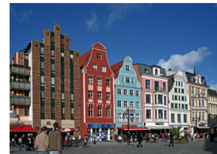
New and historical Hanseatic buildings near the central square "Universitätsplatz"