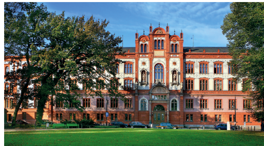
Main building "Hauptgebäude" of the University of Rostock