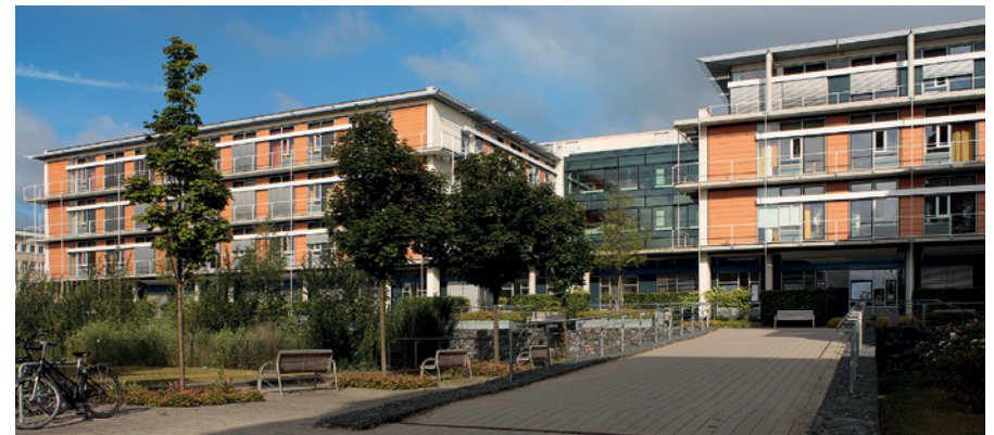
University hospital at Schillingallee

To call telephone numbers to outside the university, dial "0" before the telephone number, e.g. instead of 112 → 0 112.