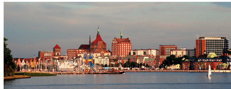
View on the city of Rostock from the river Warnow