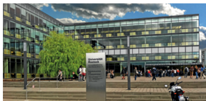
University library at Albert-Einstein-Str. 6