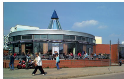
Canteen "Mensa Süd" at A.-Einstein-Str. 6a