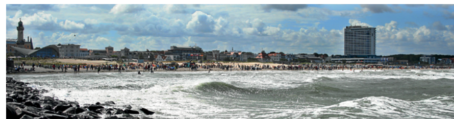
Beach of Warnemünde with lighthouse and hotel "Neptun"

The "PC Service" of the university's data center "IT- und Medienzentrum (ITMZ)"