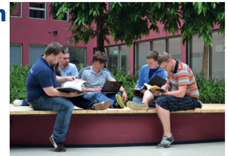
Mentoring group in the Konrad-Zuse-Haus

The mentoring groups are formed at the beginning of the semester and meet at regular intervals to discuss any questions you might have, and to get to know each other