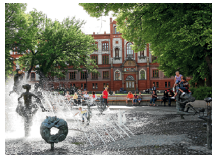
"Brunnen der Lebensfreude" and university main building at Universitätsplatz