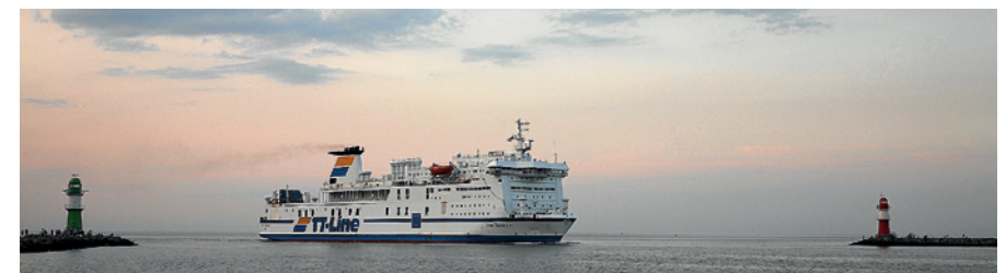
Warnemünde's harbor entrance