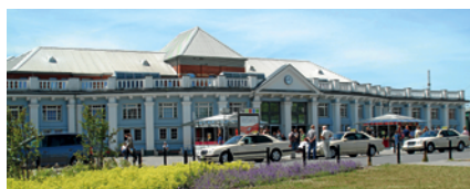
Rostock main station – northern building