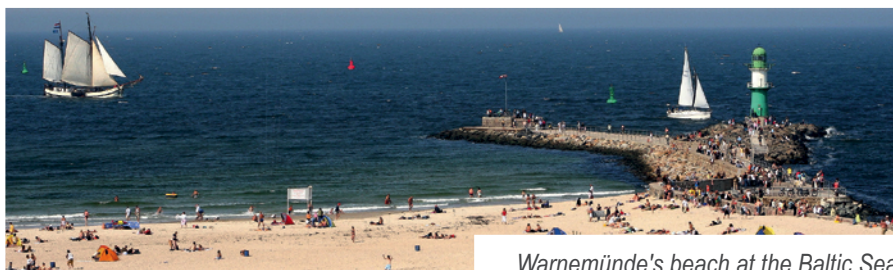
Warnemünde's beach at the Baltic Sea

Please note: The dates and dates apply to normal operation. Due to the corona pandemic, there are dynamic changes. Please inform yourself on the web.