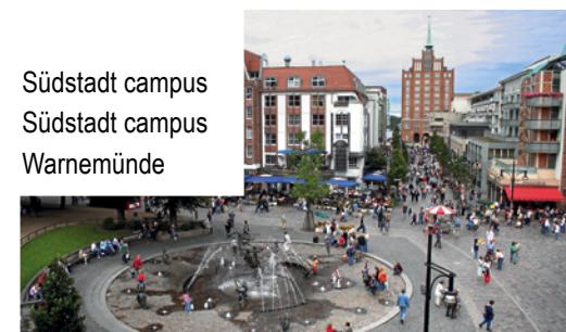
Central square "Universitätsplatz"