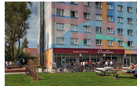
Canteen and student dorm at E.-Schlesinger-Str. 19