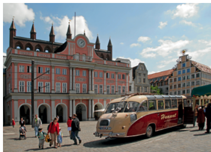
Town hall with historical sightseeing bus

If you use a bicycle, you are legally required to have a working light, bell and brakes. It is a good idea to invest in a good bike lock.