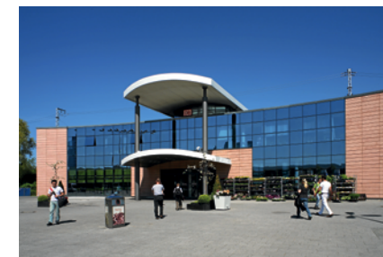
Rostock main station – southern building